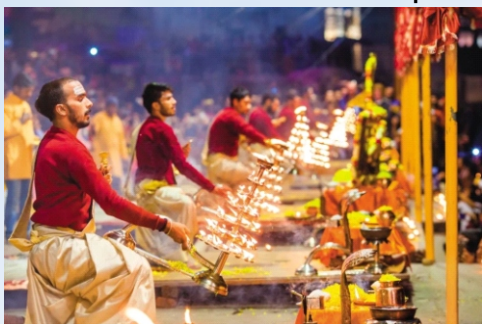
Ganga Aarti Dashashwamedh, Assi Ghat