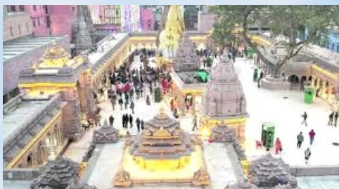
Kashi Vishwanath Temple