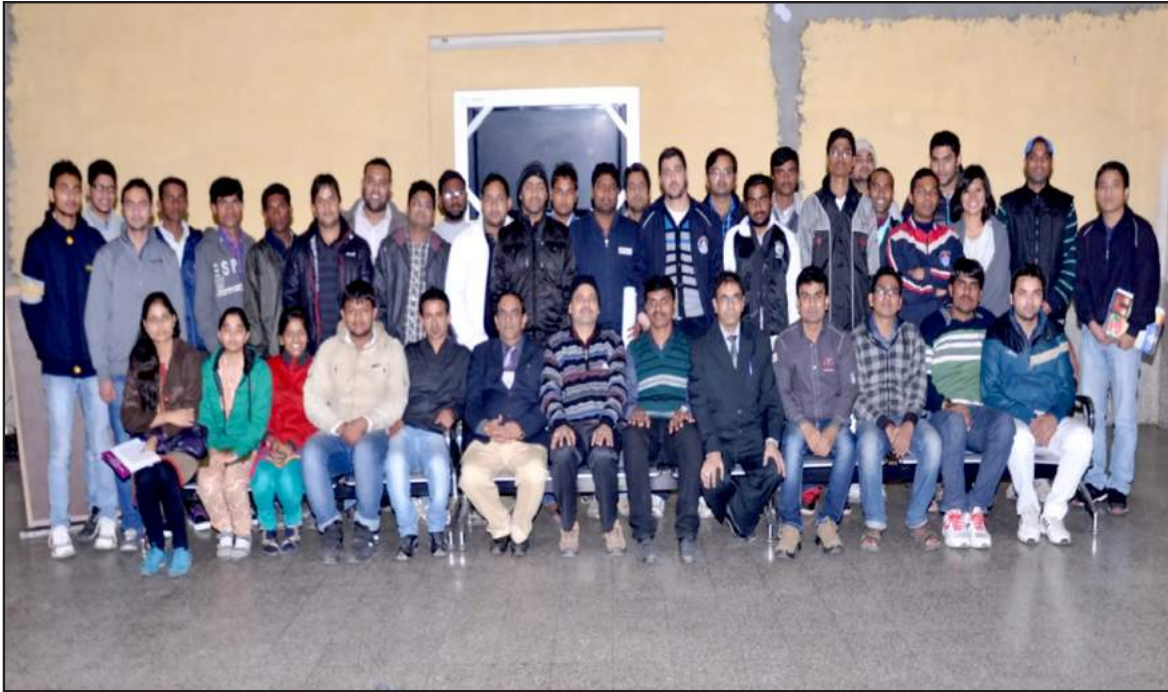
AIASA, AGM on 31st December, 2013