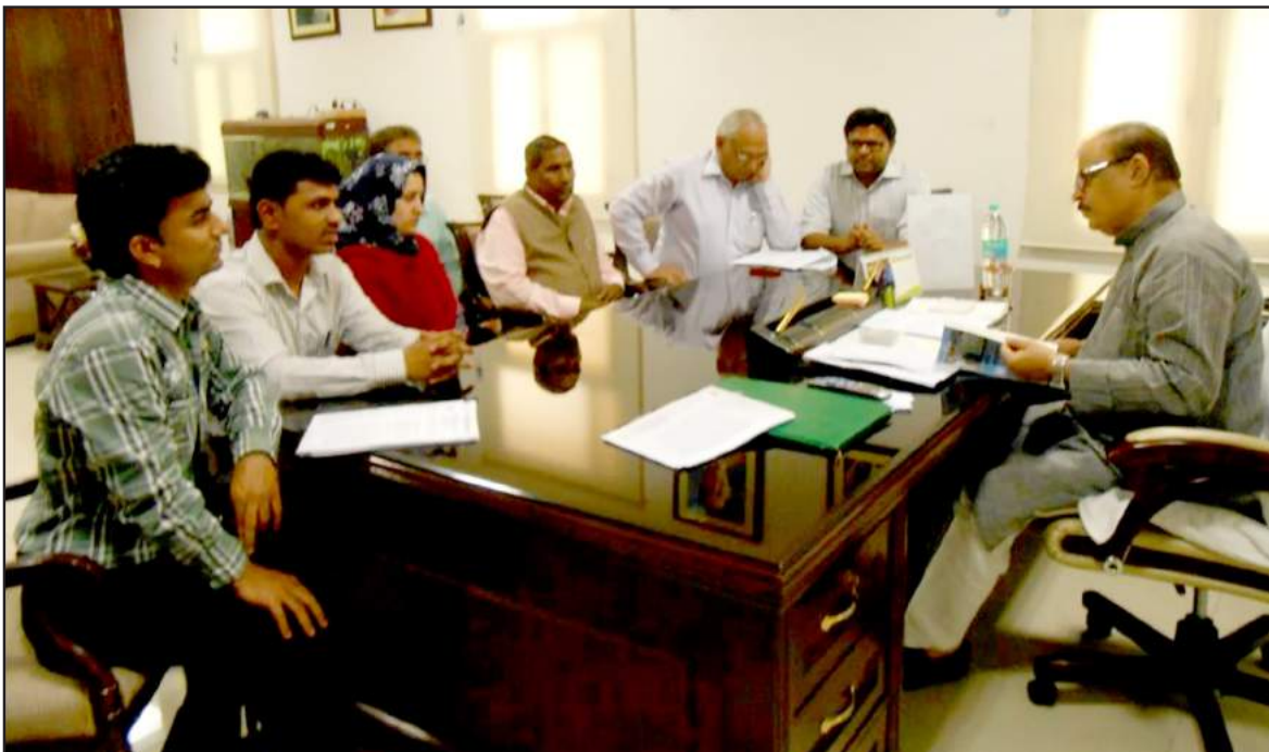
AIASA Delegation with Shri Tariq Anwar, then Hon'ble Union Minister of state for agriculture