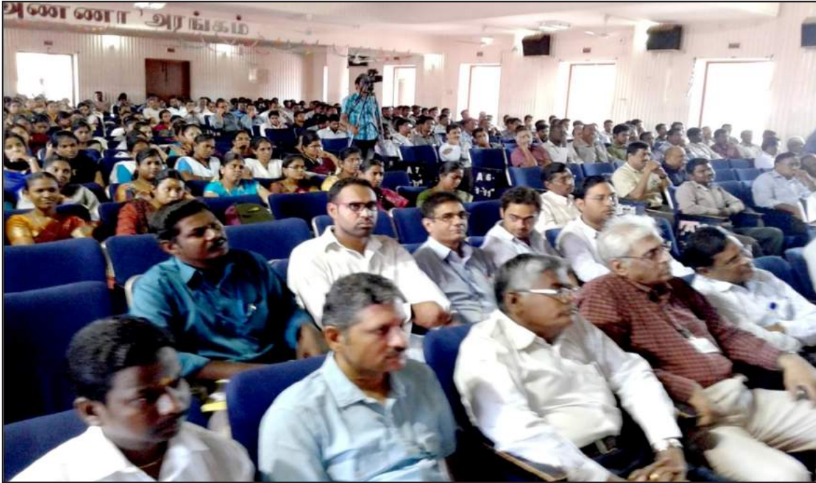
All India Agricultural Graduates Conference organized by TNAU & AIASA at TNAU Coimbatore on 5 th – 8 th May, 2014