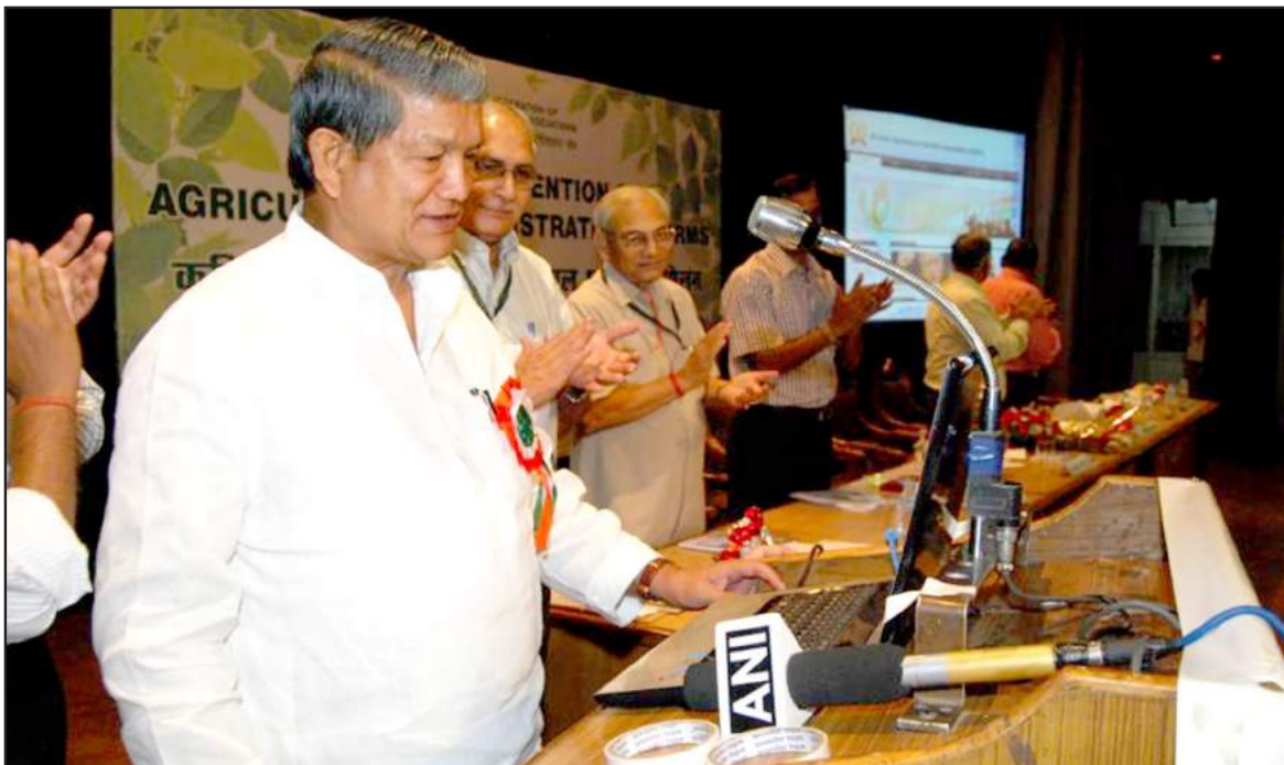
AIASA was formally launched by the then Hon'ble Union Minister of state for agriculture Shri Harish Rawat on 10/05/2011