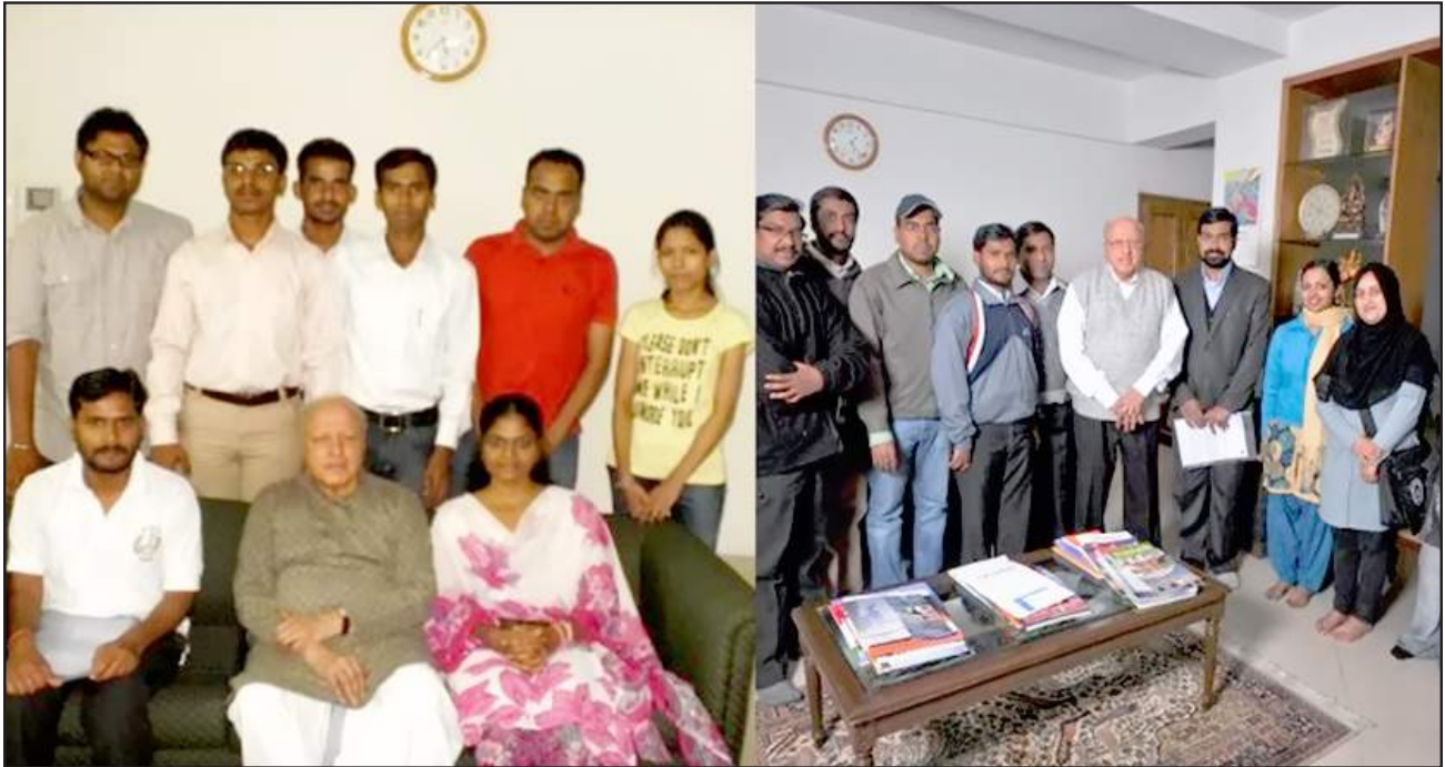
The Founder members of AIASA with Dr. M. S. Swaminathan, the Chief Patron of AIASA