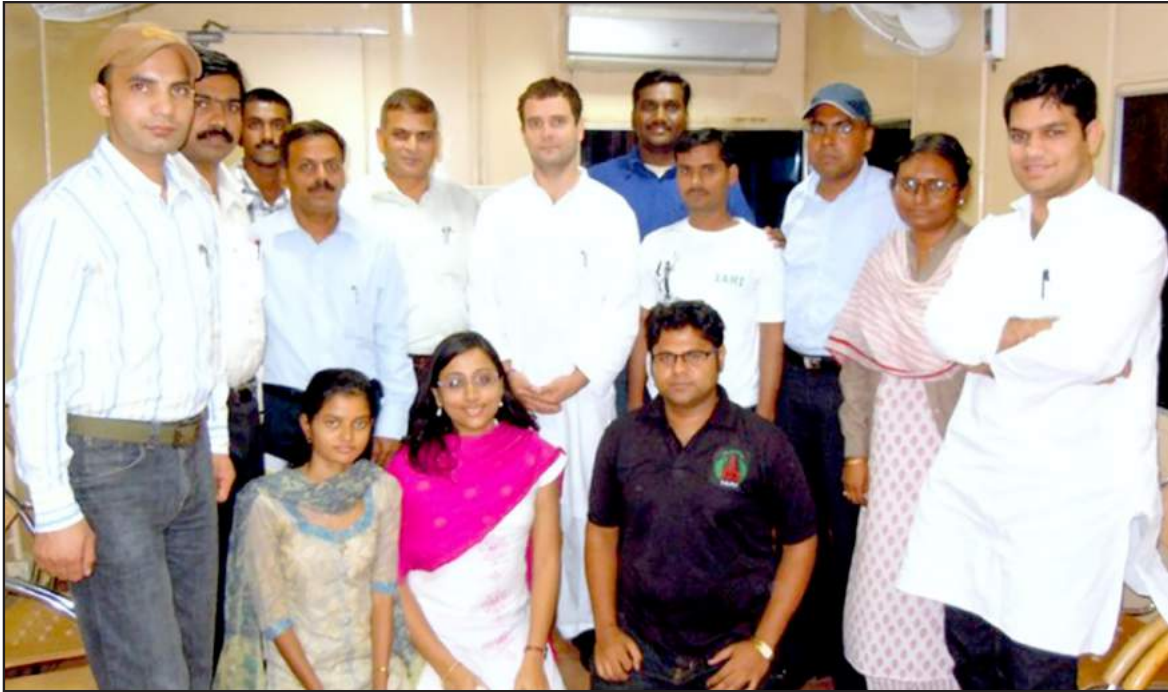
AIASA Delegation with Shri Rahul Gandhi, Member of Parliament