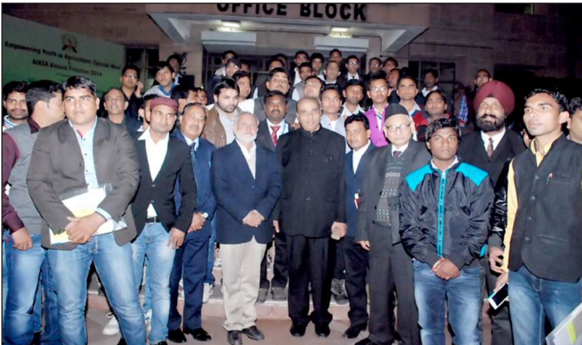
AIASA, AGM on 31st December, 2014